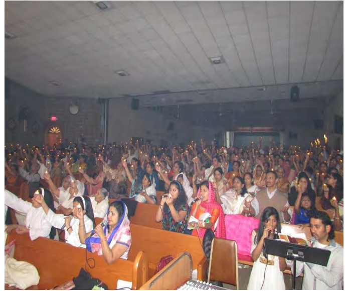
ദിവ്യ കാരൂണ്യ പ്രദീപ്തം